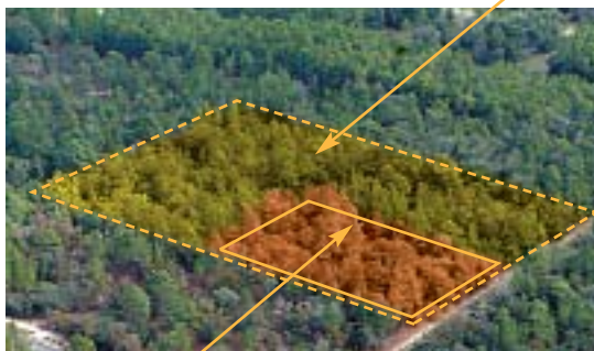
● STANDARD HOMESITE