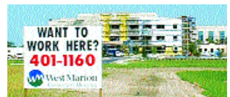
ORMC's West Marion Community Hospital

for registered nurses, licensed practical nurses, medical office staff, and for physical and occupational therapists, as well as radiologic and medical technologists. Both Munroe Regional Medical Center and Ocala Regional Medical Center have an increasing need for additional staff as they expand their hospital services.